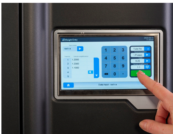
AN OVERVIEW OF THE WHOLE RACK WITHOUT POP-UP DIALOGUES - AN INSTRUMENT WITH THE USER IN MIND.