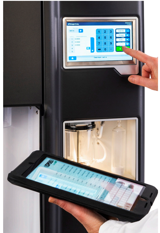
THE LABCONNECT SOFTWARE ALLOWS FOR EASY CONNECTIVITY TO YOUR LABORATORY